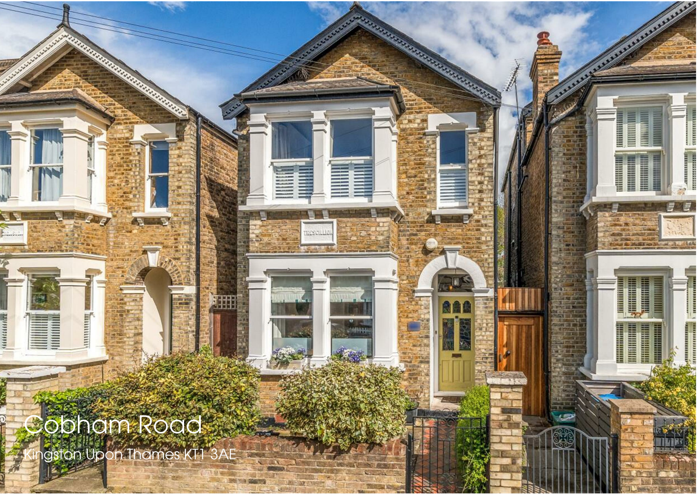
Cobham Road Kingston Upon Thames KT1 3AE

34 Richmond Road Kingston upon Thames Surrey KT2 5ED www.gibsonlane.co.uk Tel: 020 8546 5444